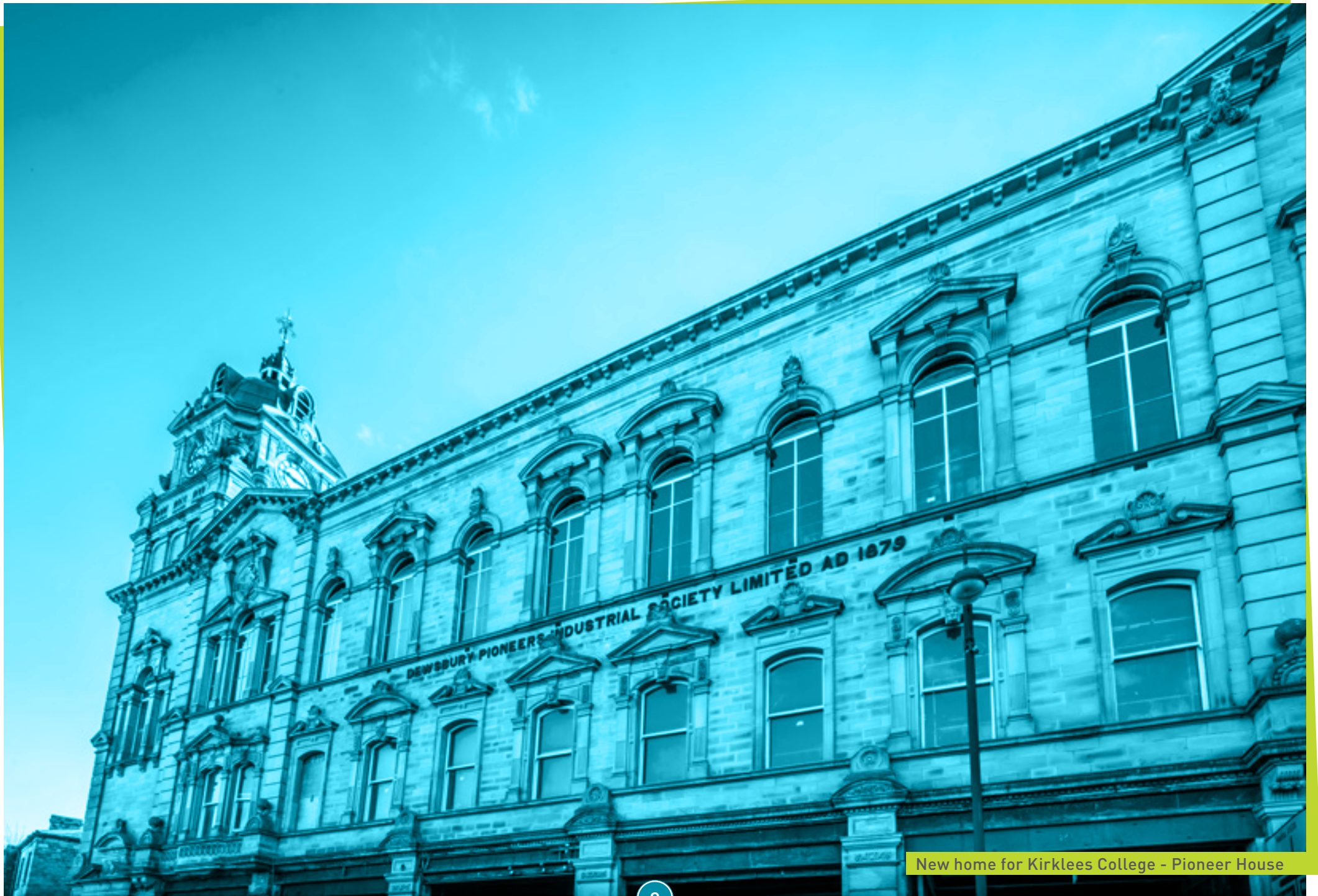
New home for Kirklees College - Pioneer House