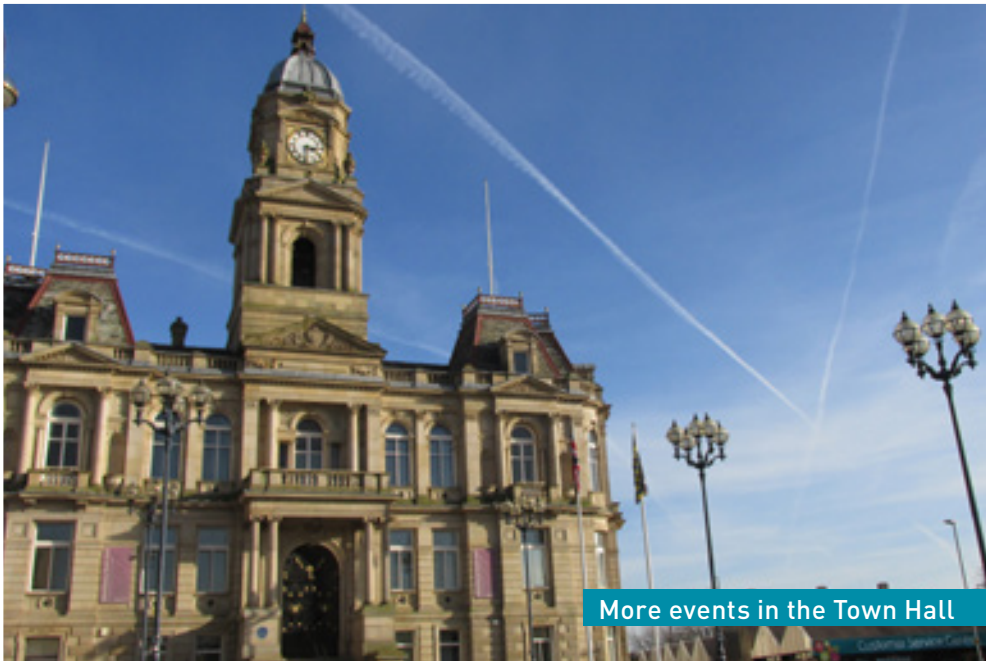
More events in the Town Hall