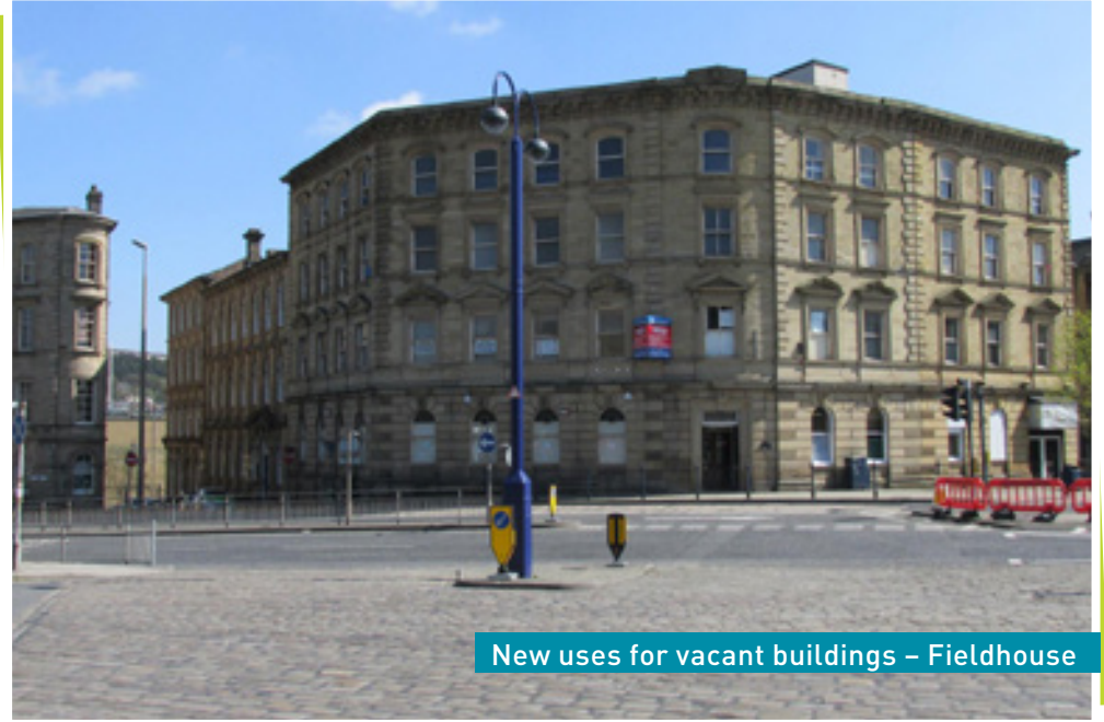
New uses for vacant buildings - Fieldhouse