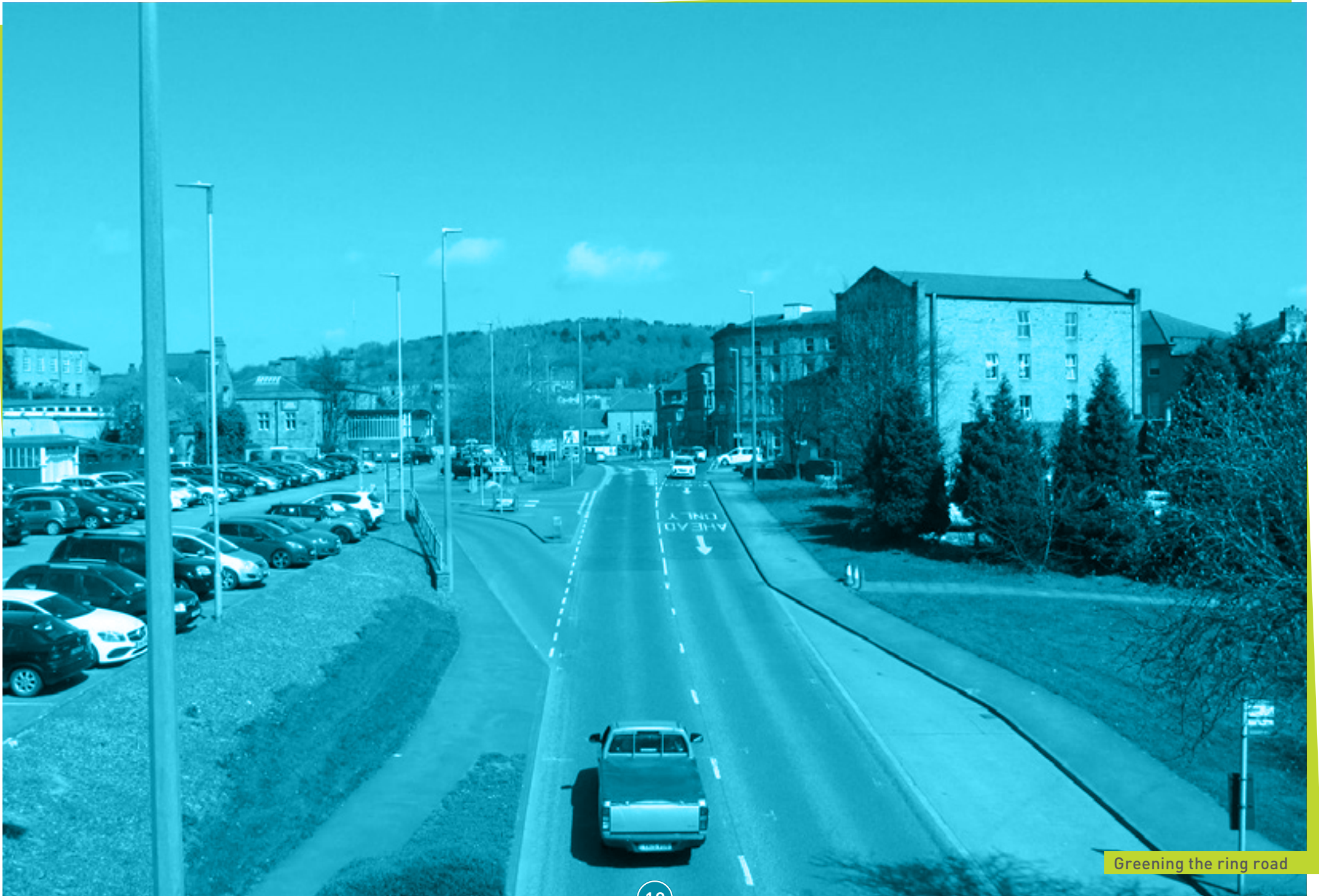
Greening the ring road