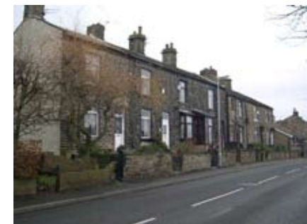
Terrace, North side of South View Road