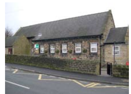
School, South View Road