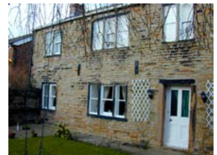
Manor Farm, South View Road