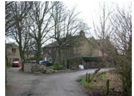
Residential dwelling, Hunsworth Lane