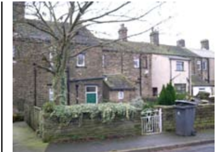
Requiring enhancement: Extensions and alterations on Verity Street

Article 4 controls are in effect on both the house you occupy and its curtilage. The ‘curtilage’ includes the garden or other surrounding land which is part of the property. The aim of the controls is to protect the dwelling houses from development likely to detract from the appearance of the conservation area in which your home is situated. In most cases planning permission will be required for changes to the front of your property because that will front on to the highway and be caught by the Direction. However, in some circumstances, permission will be required for alterations to side elevations and flank walls, for example where part of those alterations fronts on to a Relevant Location.