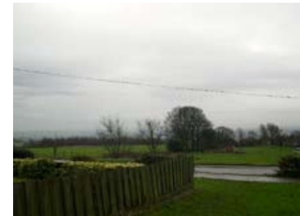
View over Recreation Ground