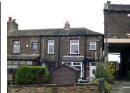
South View Road