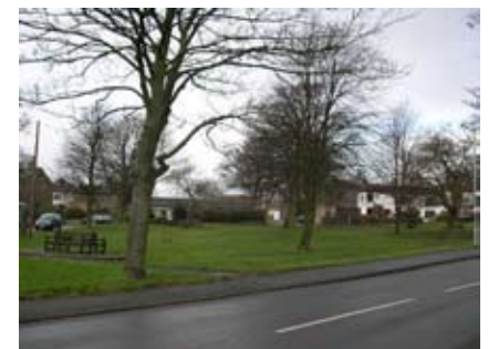
The Green, open space and tree coverage