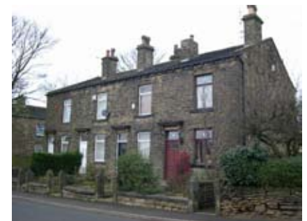
Terrace, South View Road