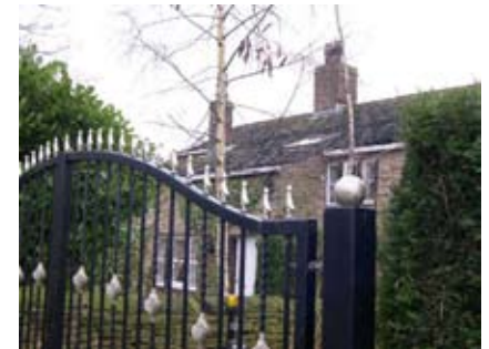
Secluded detached properties, South View Road

The walls in front of the terraced properties along South View Road are predominantly below 1 metre in height but are constructed from a variety of materials and in a variety of styles. Some are dry stone walls with vertical coping stones, others are brick and some are coursed stone walls with flat stones placed on top as the coping stone. Most of the gate posts in front of each property are blocks of rounded and ornamental stone which have been crafted into shapes from single blocks of stone.