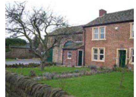
Farmhouse, South View Road

The low terraced cottages opposite the Green also add a great deal to the character of the Conservation Area. This terrace has an individual and unique design and is different from the rest of the terraced properties in the Conservation Area. They are constructed in a rural style and are characterised by their low height, horizontal emphasis and bay windows. They also have larger gardens compared to the other terraces further down the street.