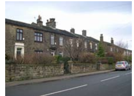
Included terraces on South View Road