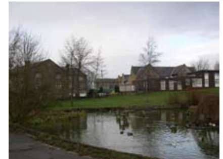
Bierley Marsh and pond

The Stocks are located on the Green between Hunsworth Lane and South View Road. It was listed in 1984 and is of a Grade II standard. It originates from the 18th Century. It has two stone posts with grooves for rails. The oak rails are recent replacements.