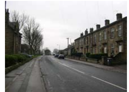
South View Road entrance point

Properties on Verity Street and on the south side of South View Road consist of bungalows and houses built in the mid to late 20th Century. The houses on the south side of South View Road (Manor Farm Court) are newly built properties which are well built stone houses but have not been included due to their age.