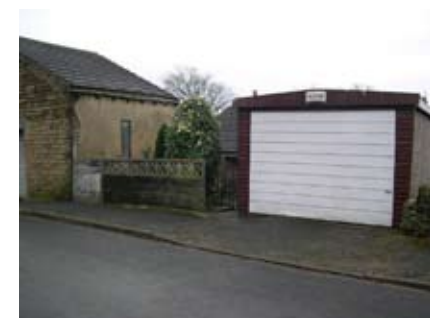
Garages, Verity Street