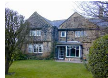
Cross House, Hunsworth Lane