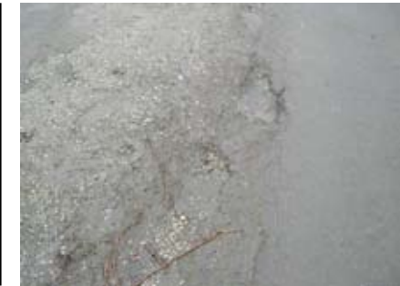
Floor surface surrounding Bierley Marsh

There are several examples of protruding windows on the terraces at the East end of South View Road in the Conservation Area boundary which have been added to the row at a later date from when the building was originally constructed. Due to this addition not being uniform along the row of terraces the character is not consistent and therefore not enhancing the Conservation Area.