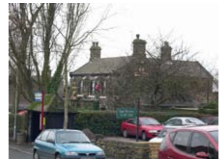
Included The New Inn on South View Road