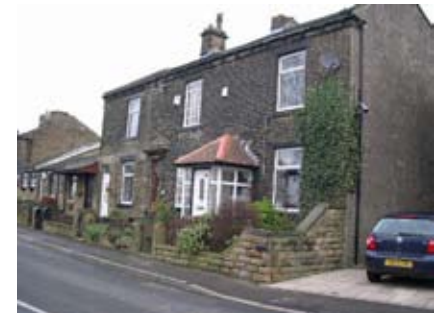
Terraces, South View Road