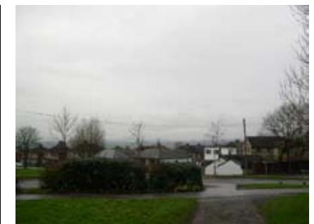
Landscape surrounding East Bierley