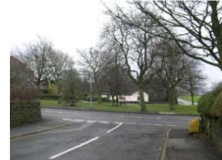
The Green, focal point of East Bierley

The properties on the South side of South View Road comprise of secluded houses with high stone walls and mature vegetation. It also includes the War Memorial and St. Luke's Church and Hall which are also detached items surrounded by green space. The North side of South View Road is where the majority of the terraced properties are located. These terraces provide a strong silhouette and are a dominant feature on South View Road. The walls on this side have been built lower and allow views of the surrounding countryside; this creates the sense of the countryside in the middle of the village.