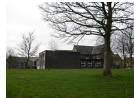
Rear of school