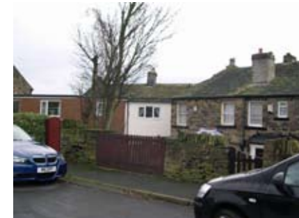
Extensions and alterations, Verity street

The overall effect of these additions and alterations has changed the character of the area and should be controlled in the future.