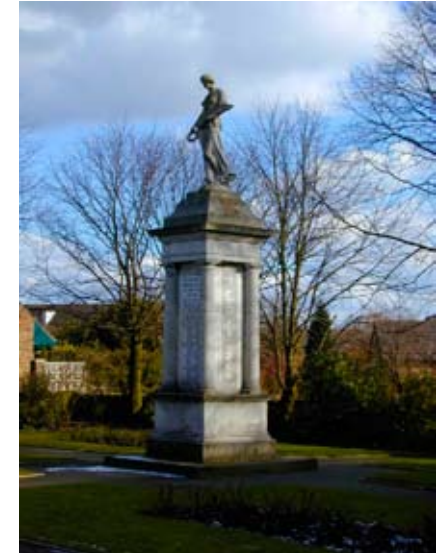
War Memorial, South View Road

The Cross base is located at Bierley Marsh beside the pond, it was listed in 1984 at a Grade II listing. The date of construction is uncertain but it probably originates from medieval times. It is a roughly hewn square block on a square base, with a suggestion of a socket in the top for shaft. It has been much worn by weather and has no identifiable features.