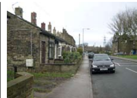
Low terrace of cottages, South View Road