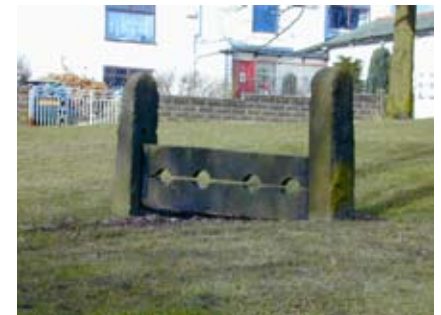
Stocks on The Green