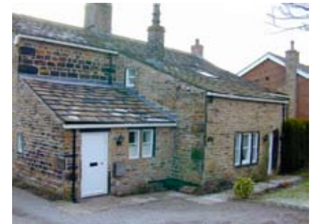
Manor Farm, South View Road