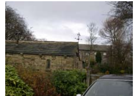
Large private gardens, Hunsworth Lane