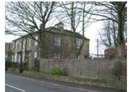
Terraces, South View Road