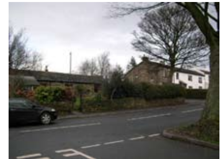
Low Cottage Terrace, South View Road