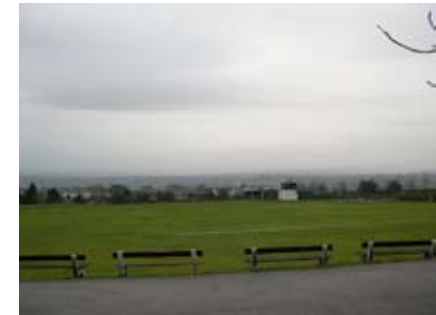
View from Cricket Club, South View Road

The Stocks are located on the Green and are another key focal point of the village. The setting of the Stocks and other listed structures such as the Cross Base and the War Memorial are very important for the Conservation Area.