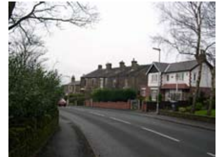
Terrace, South View Road

There are also a few small shops on the corner of The Green and South View Lane.