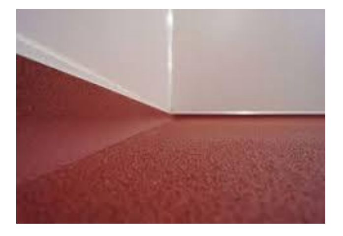
Example of slip resistant floor