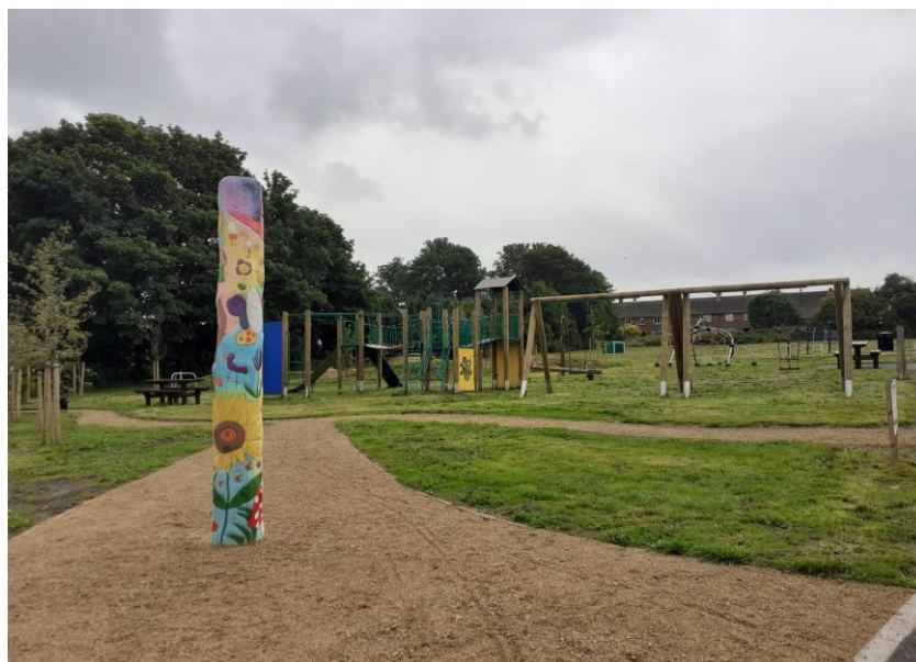
Skelmanthorpe recreation ground improvement project 2019/20 – Completed works