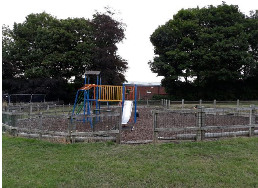
Skelmanthorpe recreation ground improvement project 2019/20 – Before works