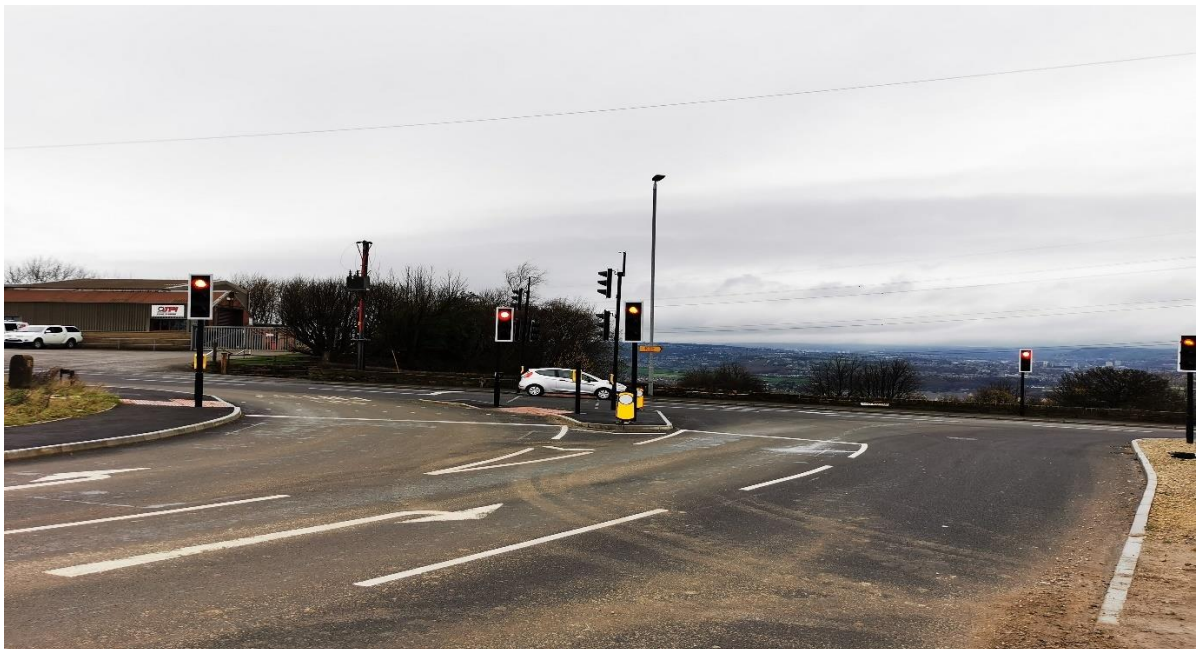
Housing developments at Lindley Moor contributed to new signalised junction at Crosland Road/Lindley Moor Road