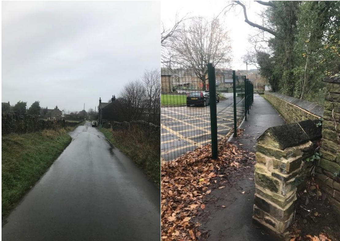
Housing development at Cross Lane Scholes contributed to passing places at Rycroft Lane and housing development at Commercial Road, Skelmanthorpe contributed to the formation of new link between the development and Skelmanthorpe First School.