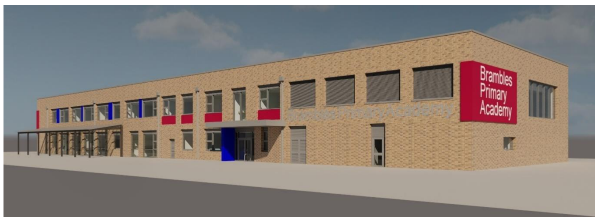
New Brambles primary school, Clare Hill, Huddersfield – artists impression of south west elevation