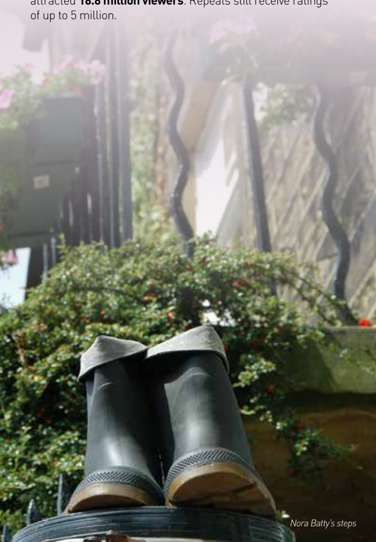
Nora Batty's steps