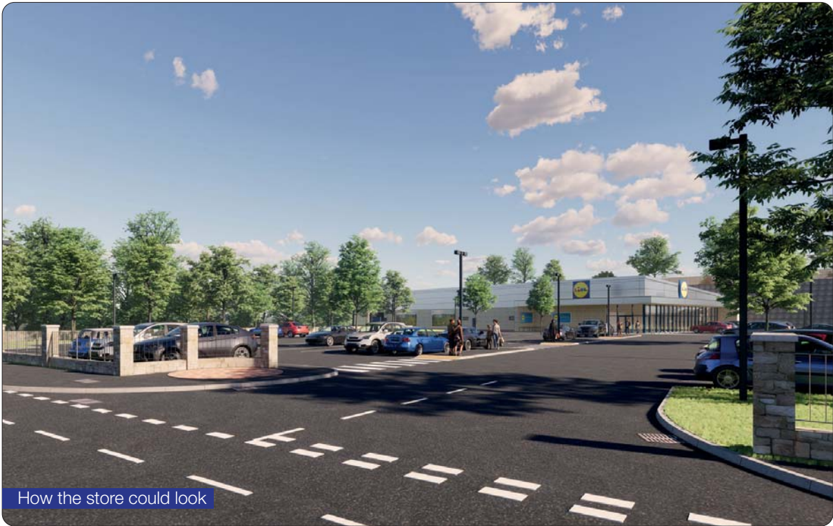
How the store could look