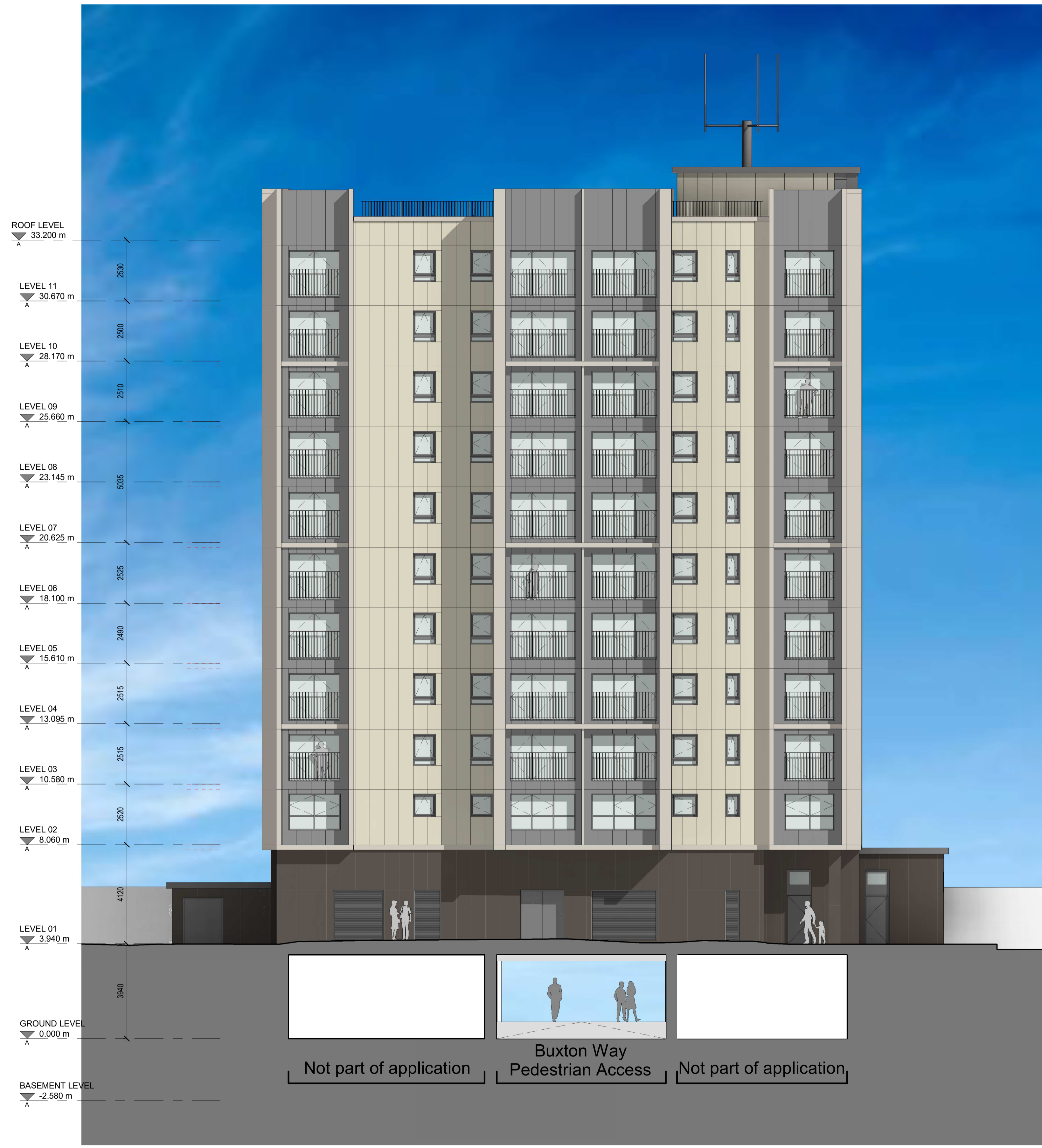
2 EAST ELEVATION 1 : 100