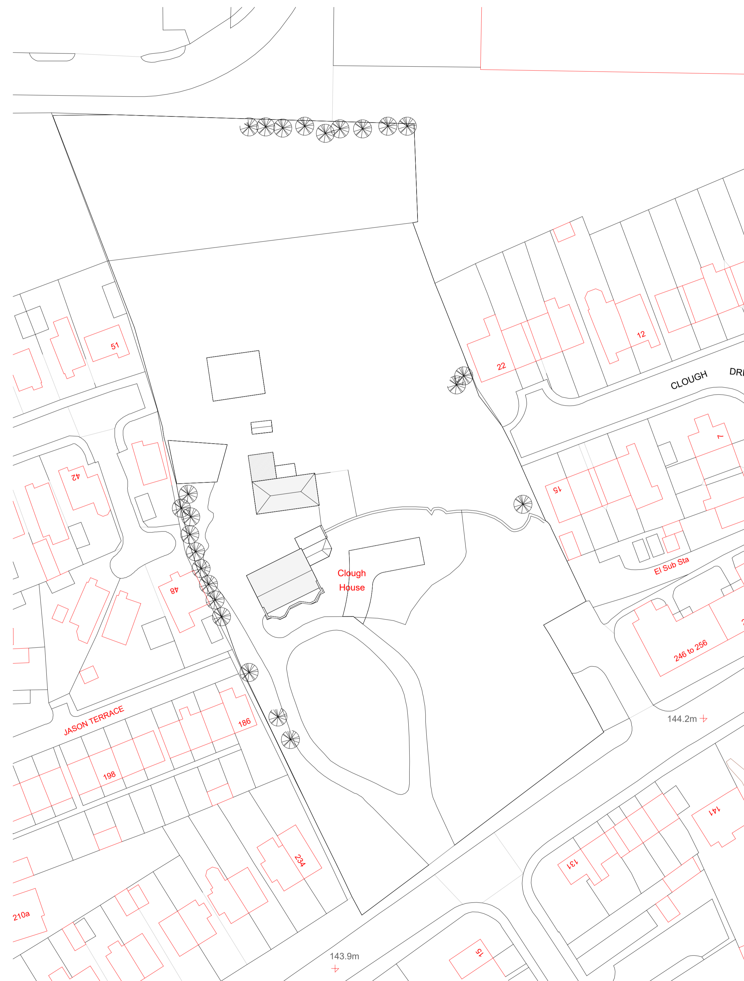
1 EXISTING SITE PLAN 1 : 500