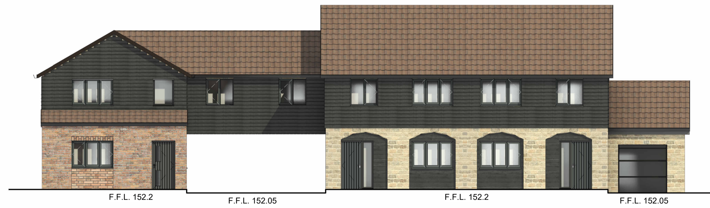
1 FRONT ELEVATION - SOUTH 1 : 100