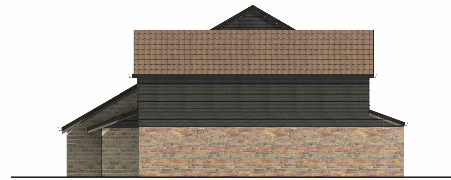
2 SIDE ELEVATION 1 - WEST 1 : 100