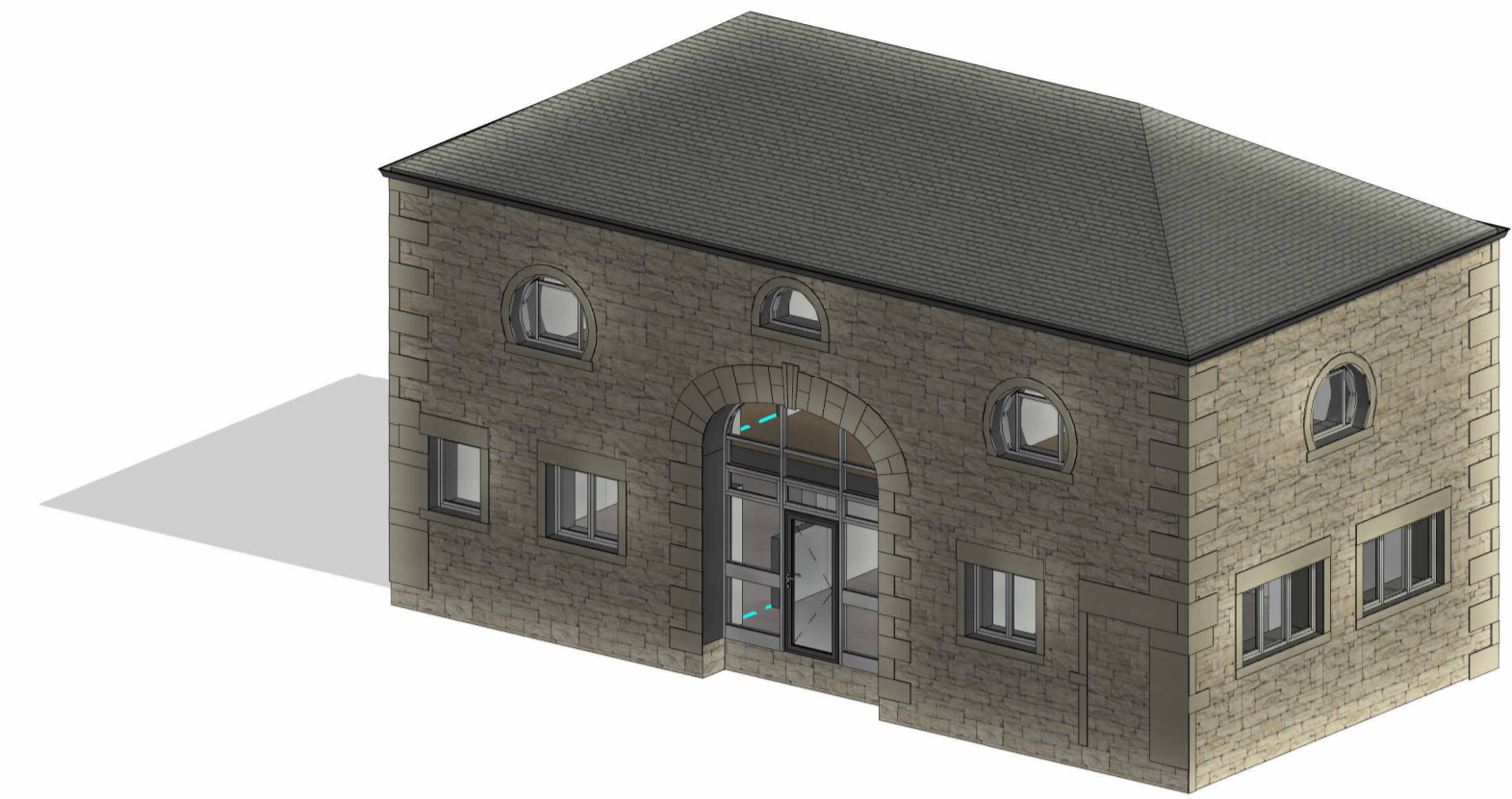
5 FRONT 3D VIEW