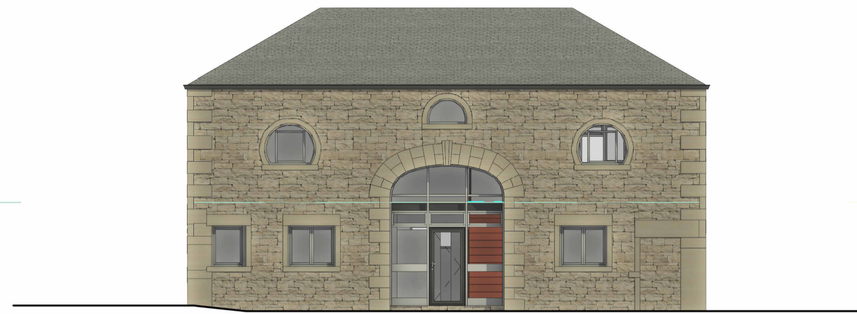
1 FRONT ELEVATION - SOUTH 1 : 100