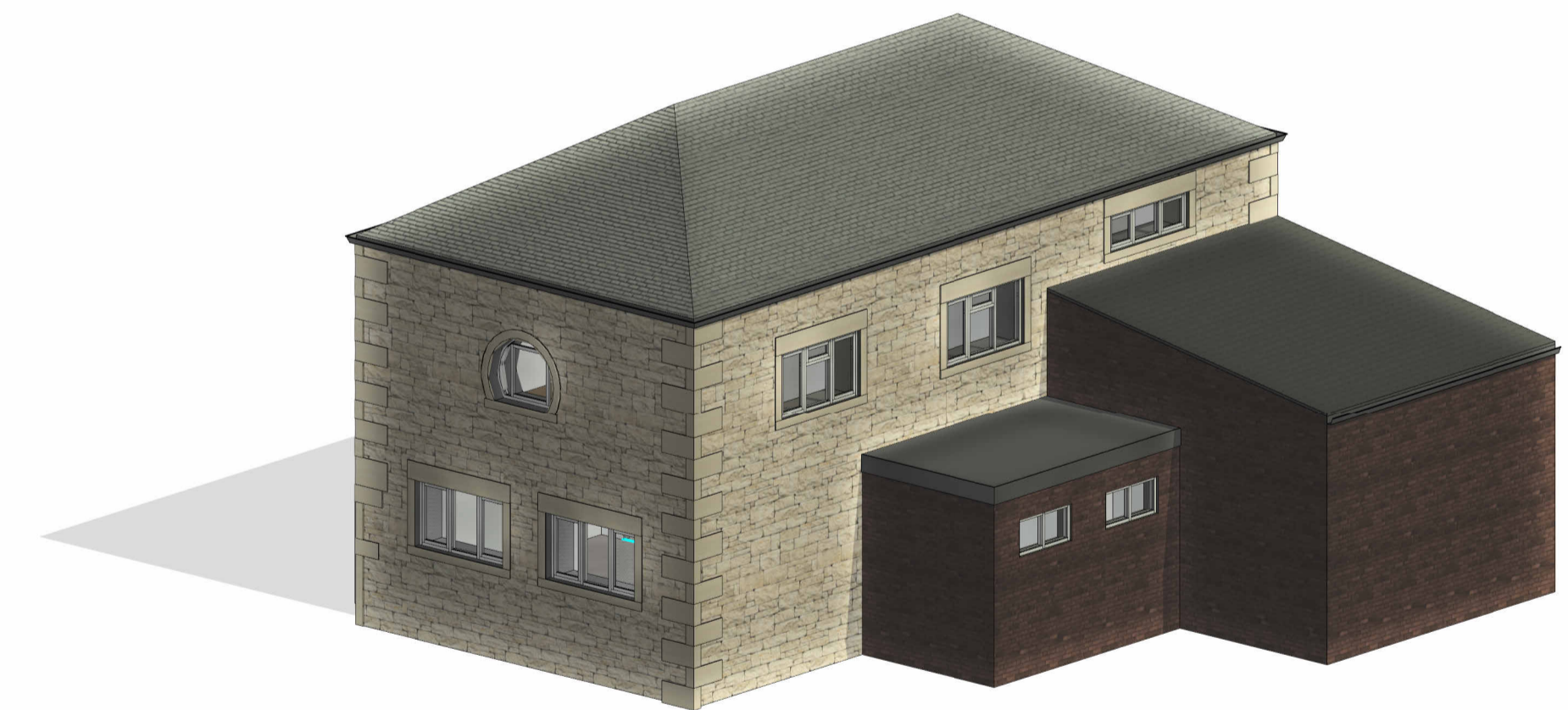
6 REAR 3D VIEW