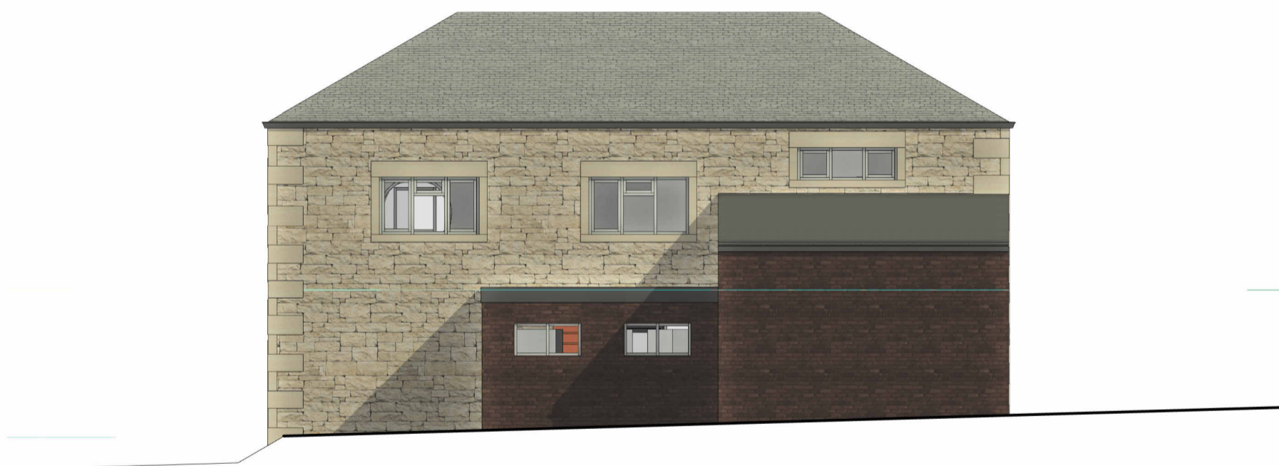
2 REAR ELEVATION - NORTH 1 : 100