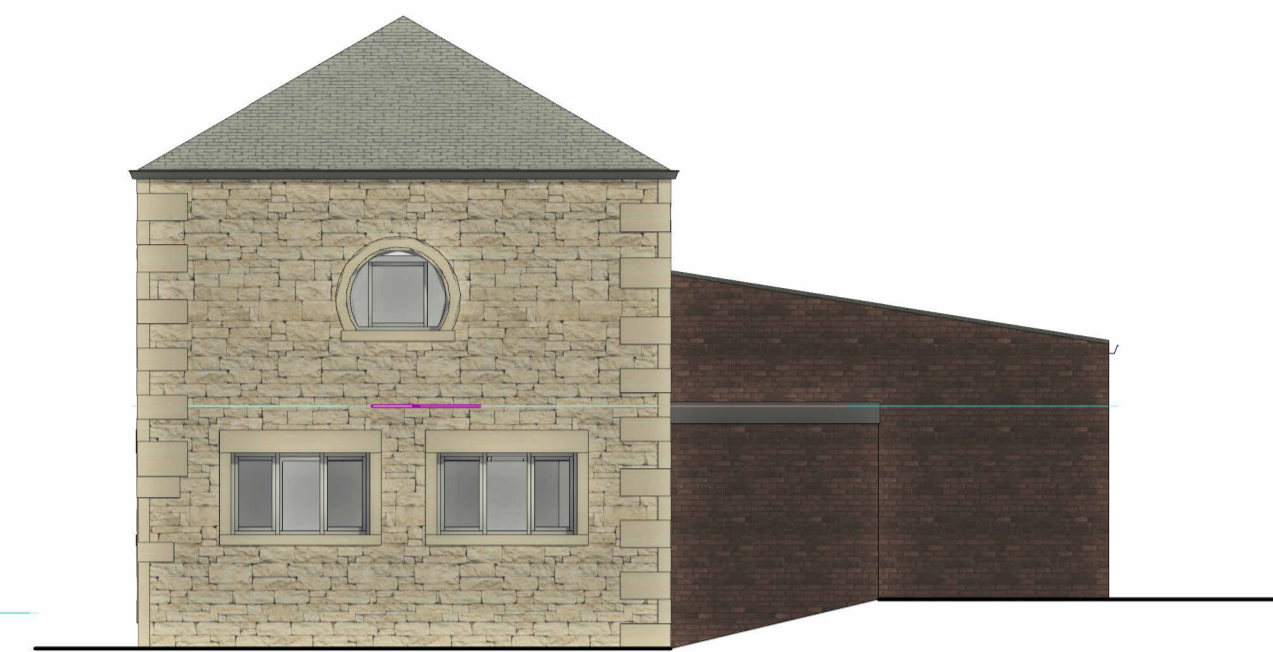
3 SIDE 1 ELEVATION - EAST 1 : 100