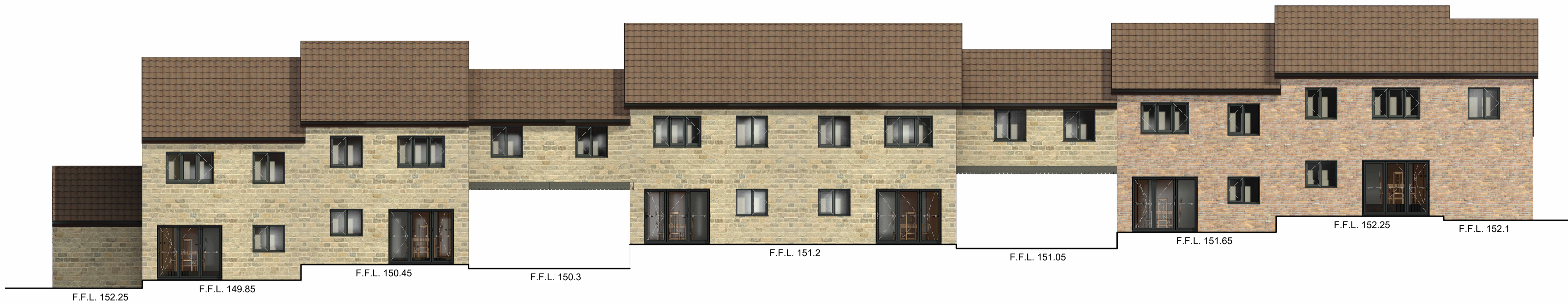
3 REAR ELEVATION - EAST 1 : 100