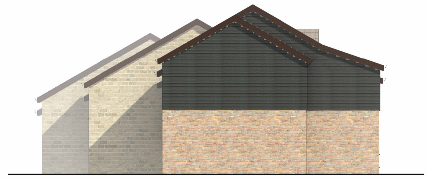
4 SIDE 2 ELEVATION - NORTH 1 : 100