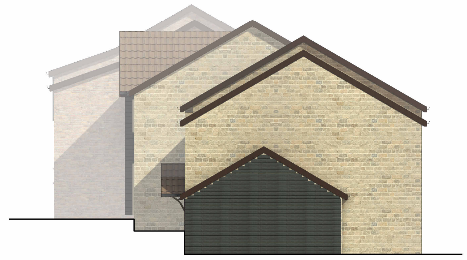
2 SIDE 1 ELEVATION - SOUTH 1 : 100