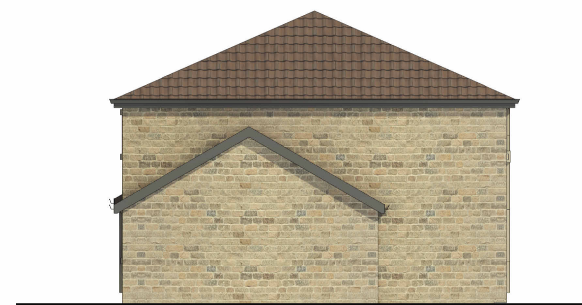
4 SIDE ELEVATION - EAST 1 : 100