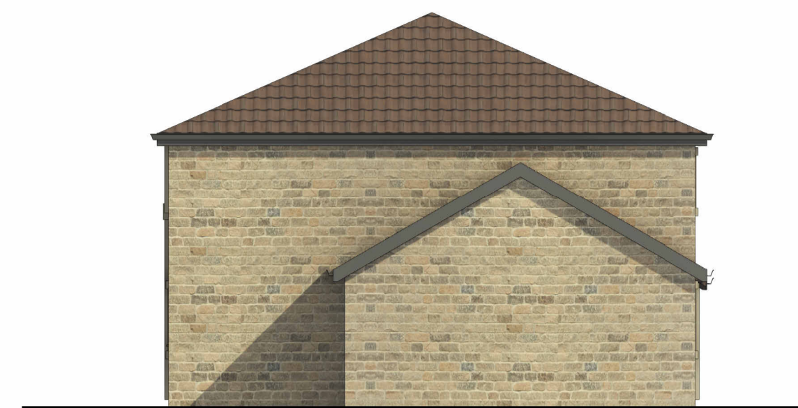
2 SIDE ELEVATION - WEST 1 : 100