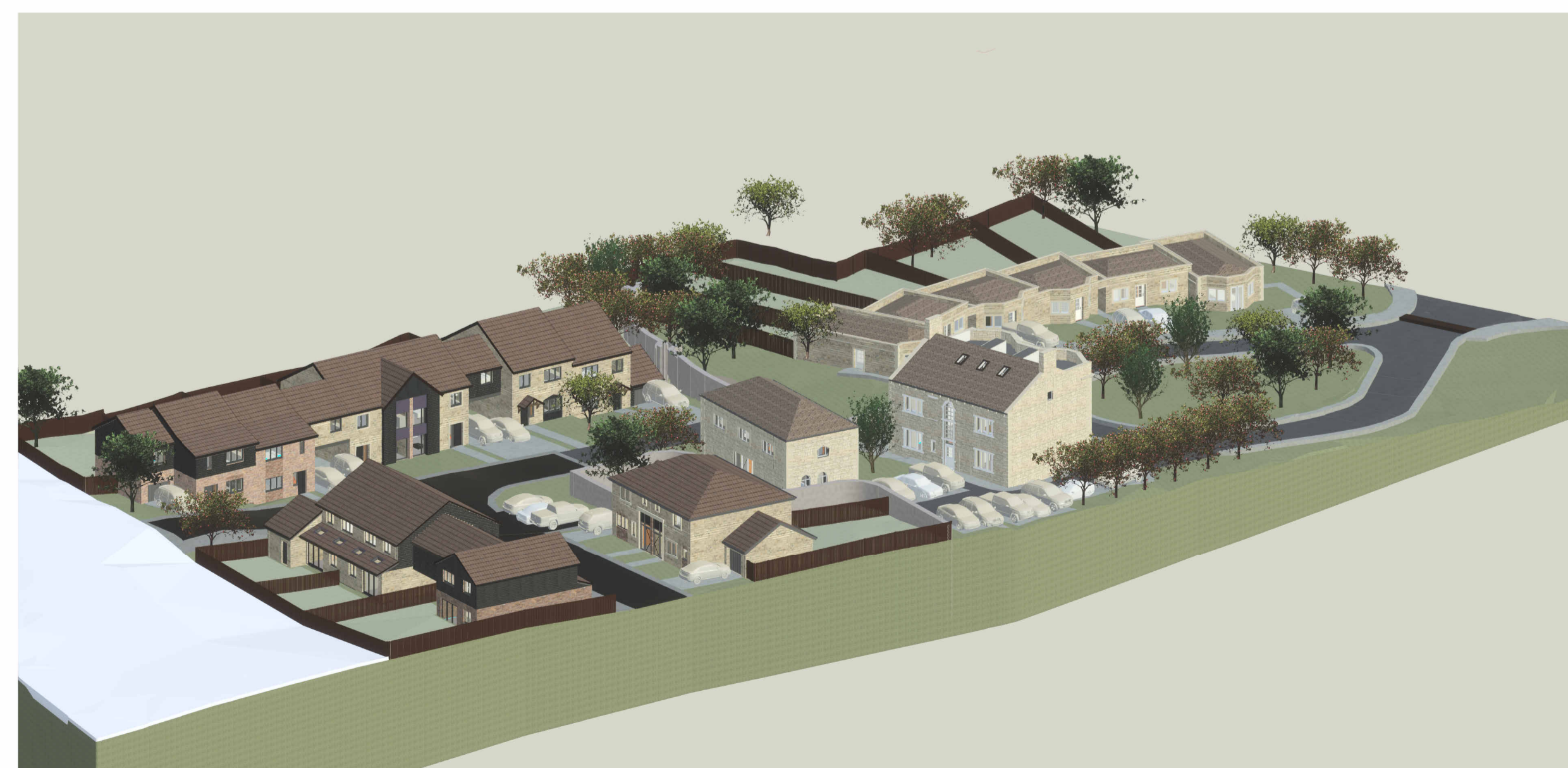
3 3D VIEW 2