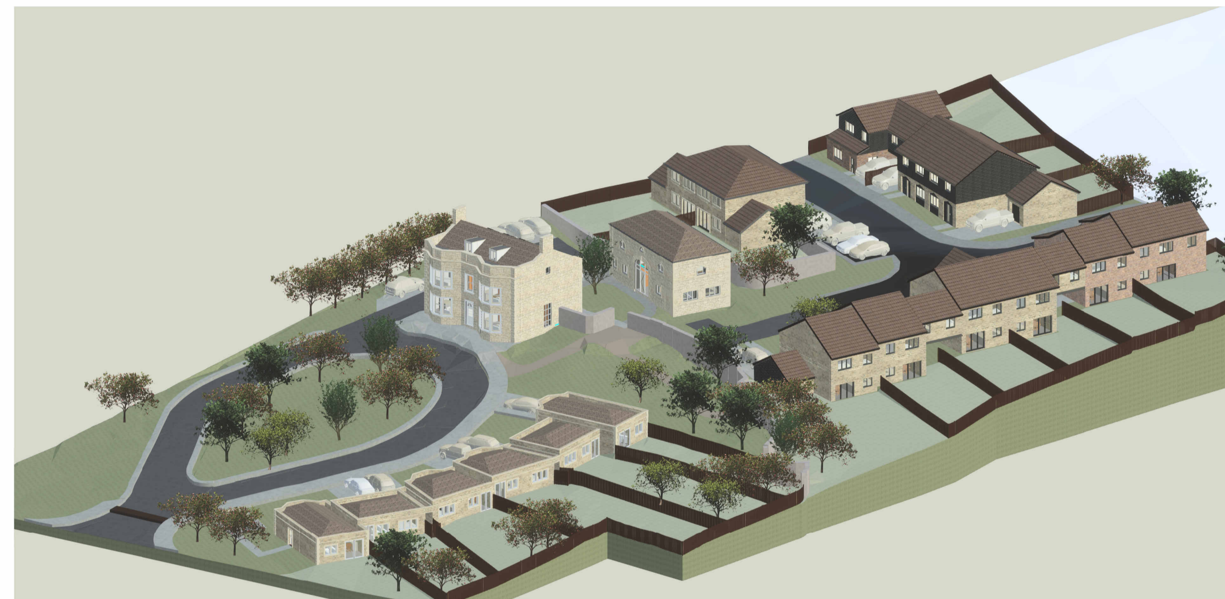
2 3D VIEW 1

Row of bungalows designed to match Clough House.