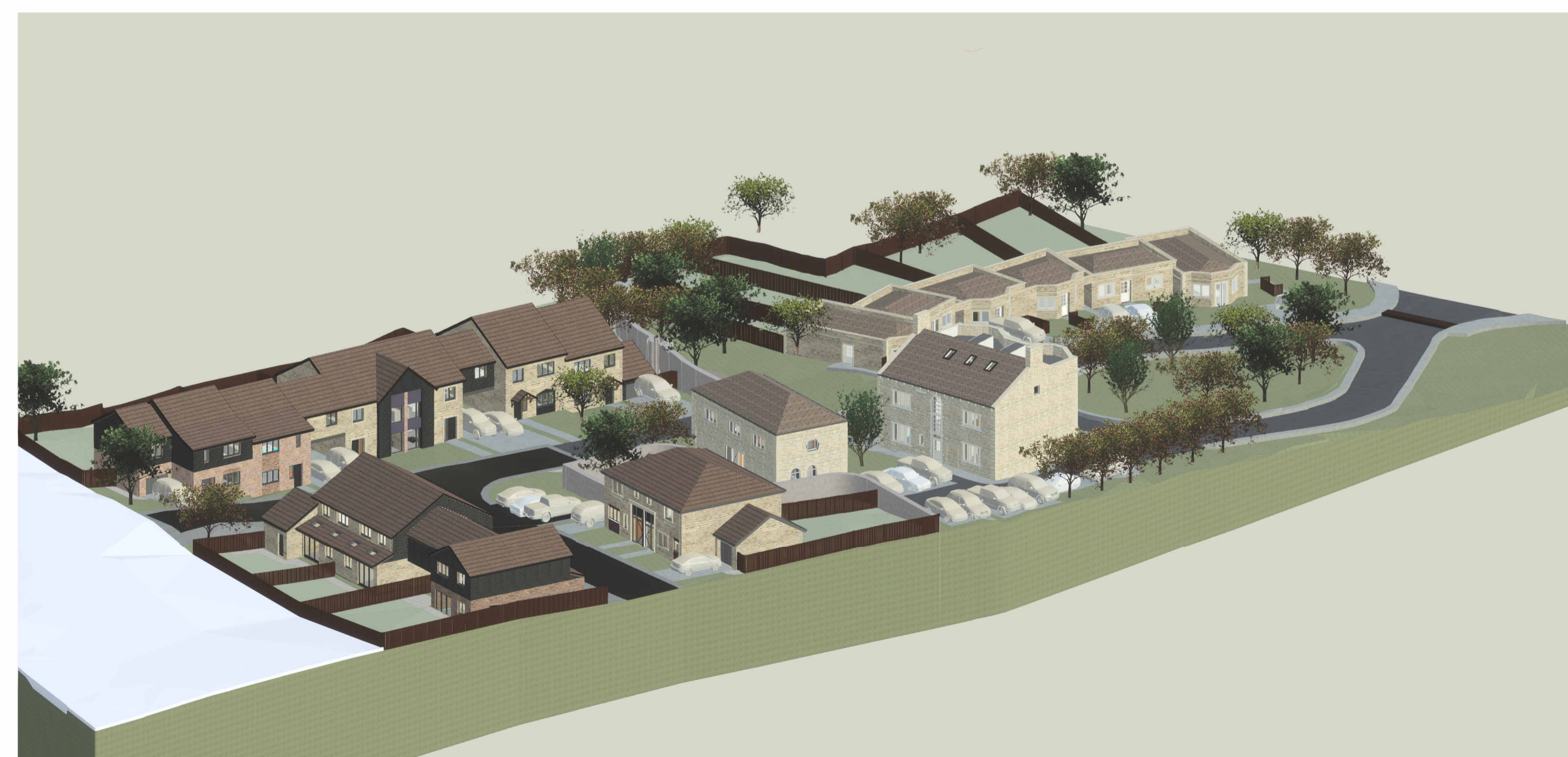
3 3D VIEW 2